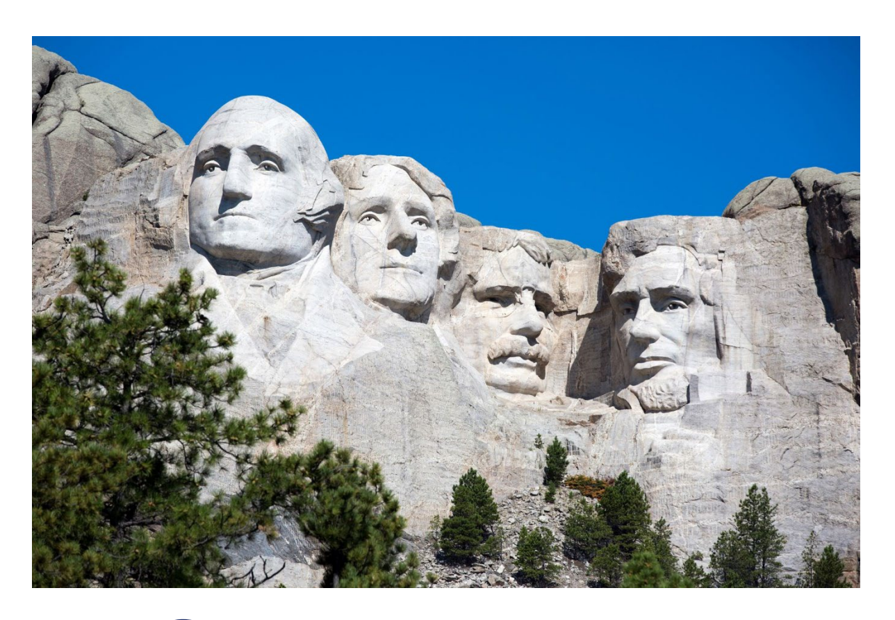
SD at a glance